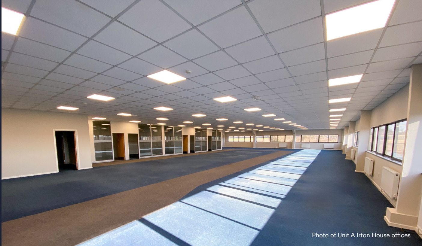
Photo of Unit A Irton House offices