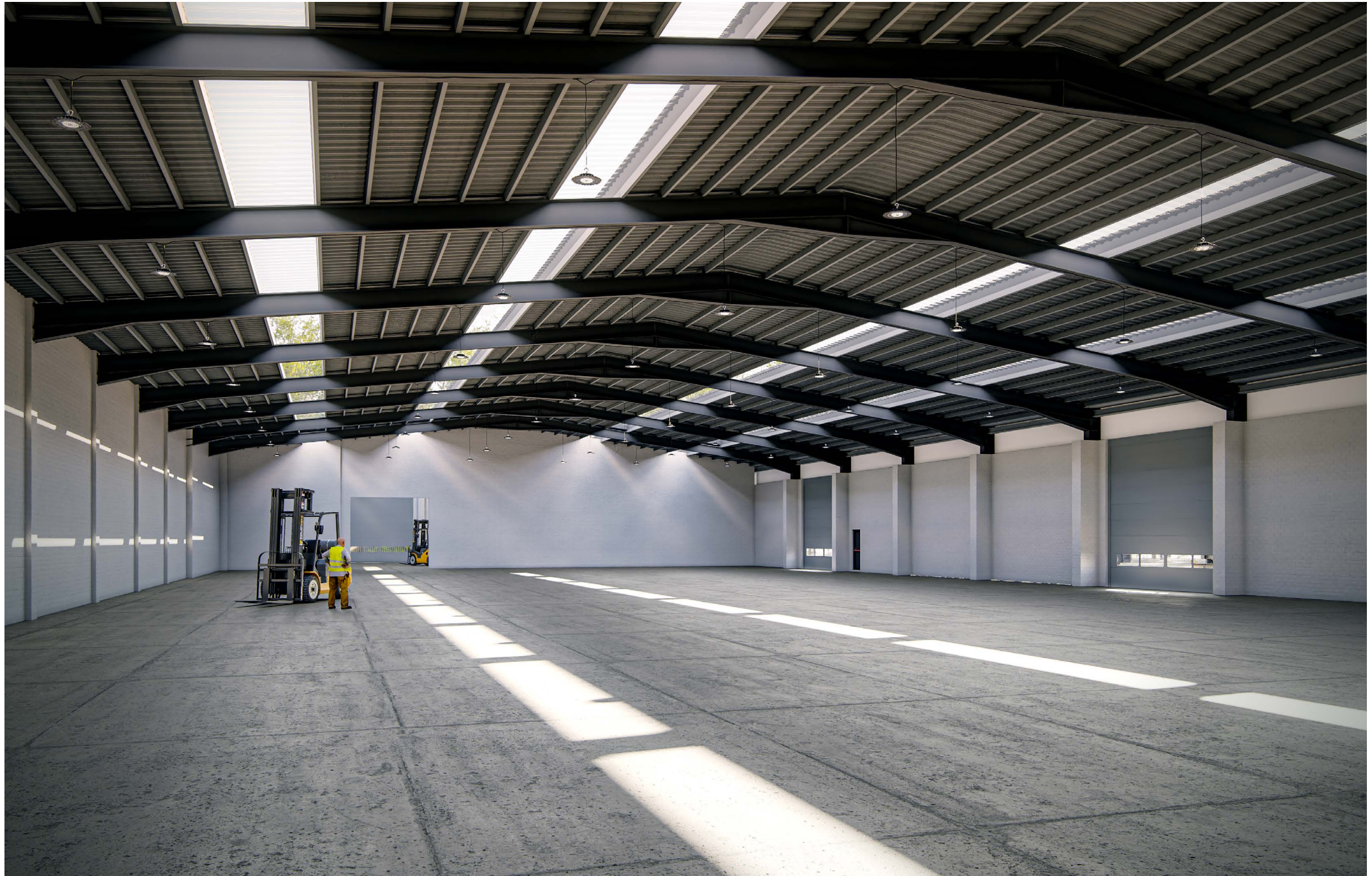
Building 3A Bays C&D, Hill Top Industrial Estate, West Bromwich, West Midlands, B70 0TX