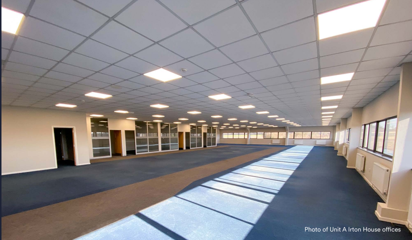
Photo of Unit A Irton House offices