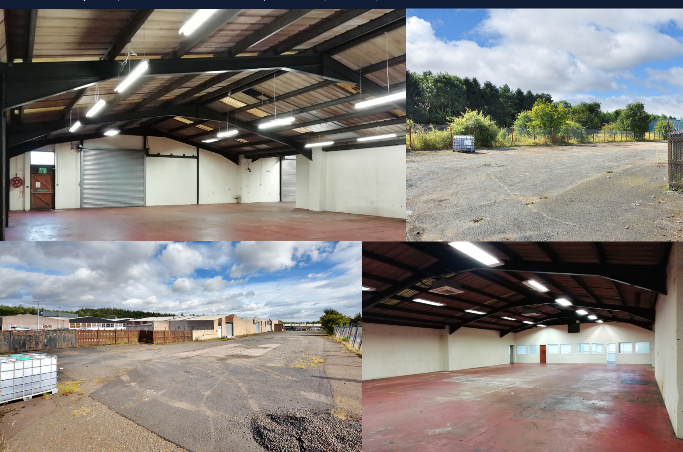
11B Faraday Road, Southfield Industrial Estate, Glenrothes, Scotland, KY6 2RU