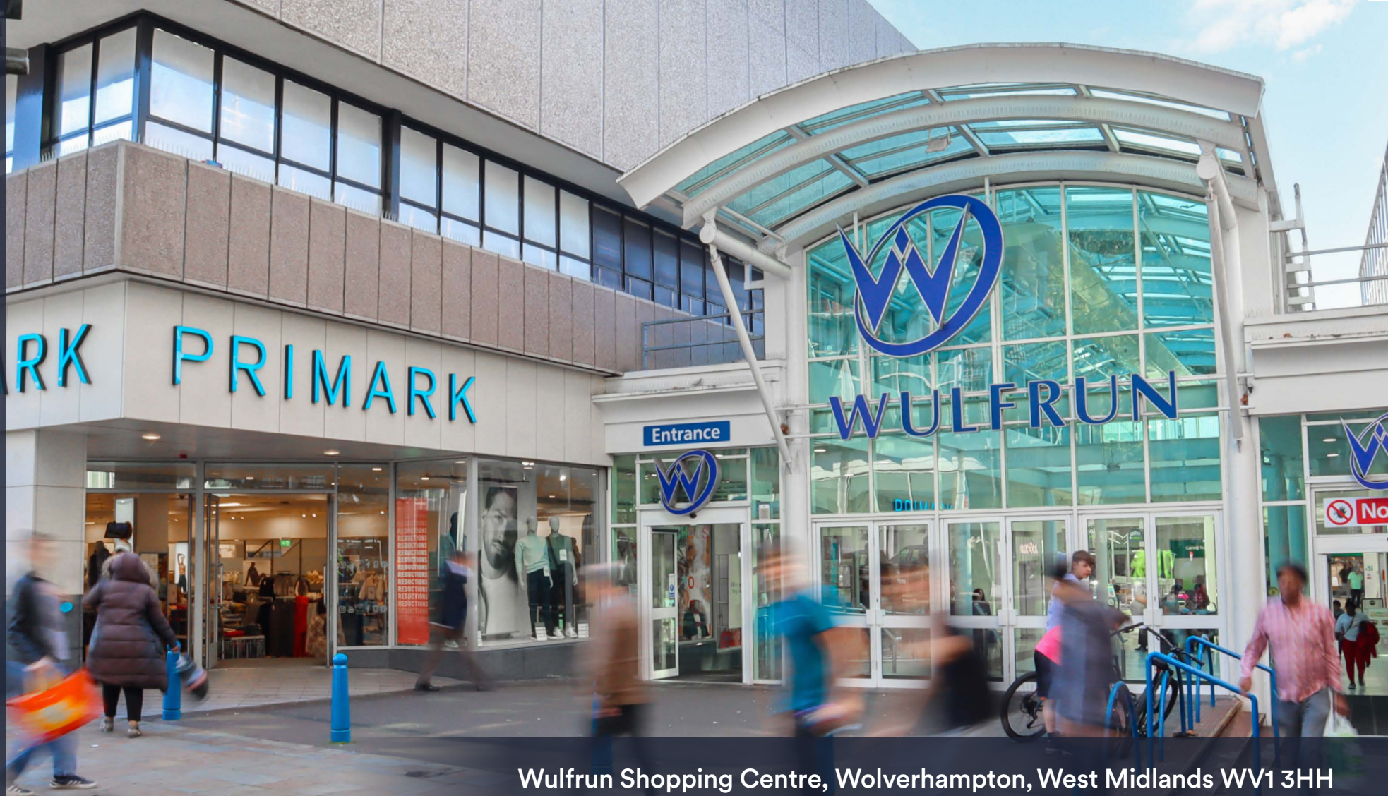
Wulfrun Shopping Centre, Wolverhampton, West Midlands WV1 3HH