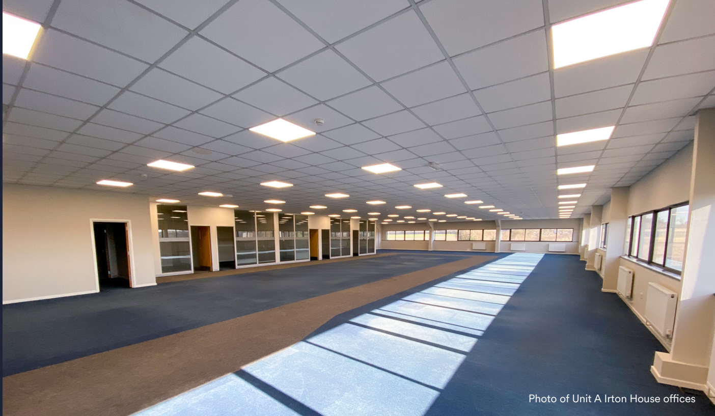
Photo of Unit A Irton House offices